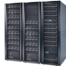
Symmetra PX 160 with 6 minutes of runtime (PF=1)