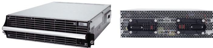
16 kVA/kW power modules provide high efficiency even at low load levels