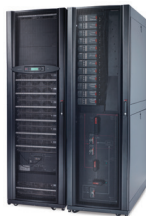
Symmetra PX 96 with power distribution and 6 minutes of runtime (PF=1)