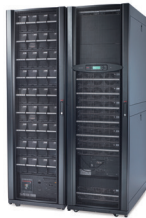
Symmetra PX 96 with 6 minutes of runtime (PF=1)