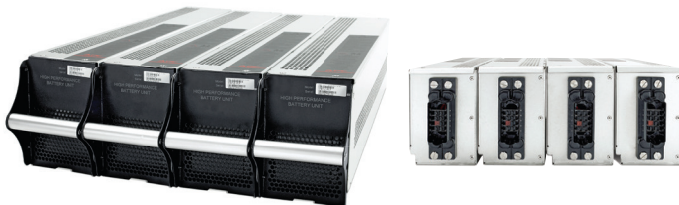
Modular batteries provide reduced MTTR, scalable runtime, and battery monitoring at the individual module level