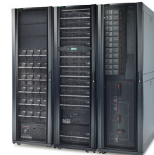
Symmetra PX 96 with power distribution and 6 minutes of runtime (PF=1)