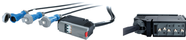
Factory-assembled and -tested power distribution modules feed power to IT racks