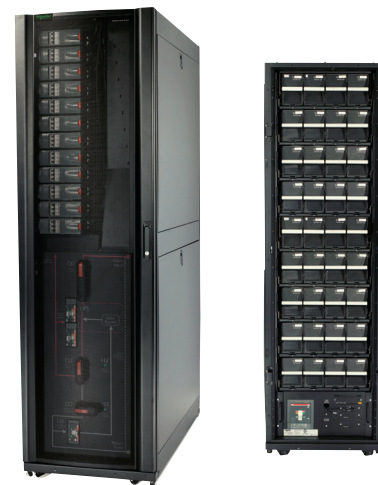
3-in-1 modular power distribution, maintenance bypass, and battery cabinet