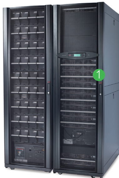
Symmetra PX 96

Add modular power distribution to your Symmetra PX 96/160 kW with no footprint penalty — a single enclosure houses modular PDU, batteries, and maintenance bypass.