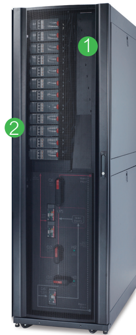
Modular PDU for Symmetra PX 96/160 kW

Each PDM consists of an industry standard circuit breaker, branch current monitoring, output cable, and connector plug combined into a factory-assembled and -tested module that feeds power to IT racks.