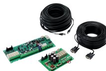
Third-party switchgear kit