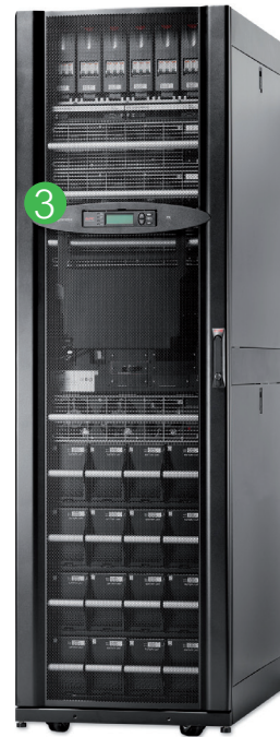
Symmetra PX 48 with integrated modular PDU