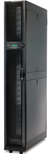
Modular remote power panel