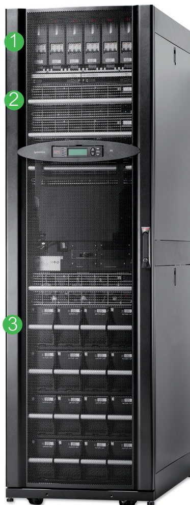
Scalable to 48 kW

Swappable battery modules feature advanced battery monitoring and temperature-compensated battery charging that extends battery life.