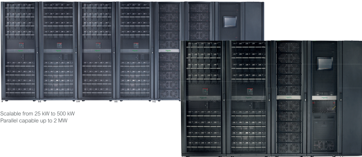
Scalable from 25 kW to 500 kW Parallel capable up to 2 MW