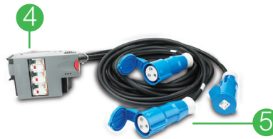
Power distribution module with RCD