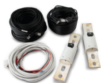
Battery breaker enclosure fuse kits (500 A and 1000 A)