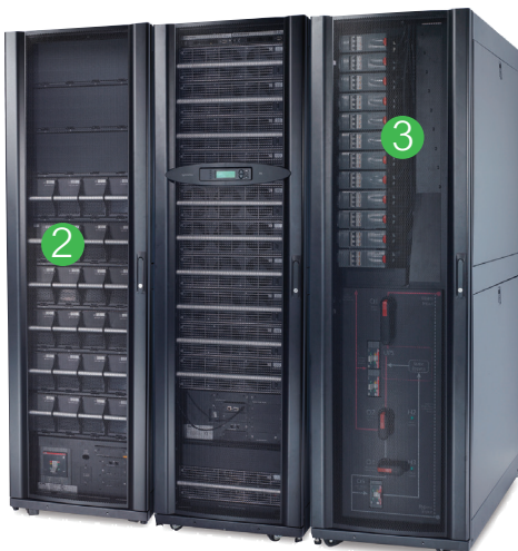
Symmetra PX 160 with modular power distribution Scalable to 160 kW