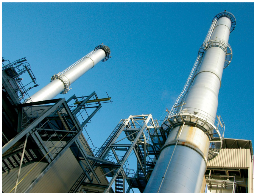
Schneider Electric Foxboro DCS key power station upgrade

“Schneider Electric delivered a significant amount of flexibility and capabilities to the system design.”