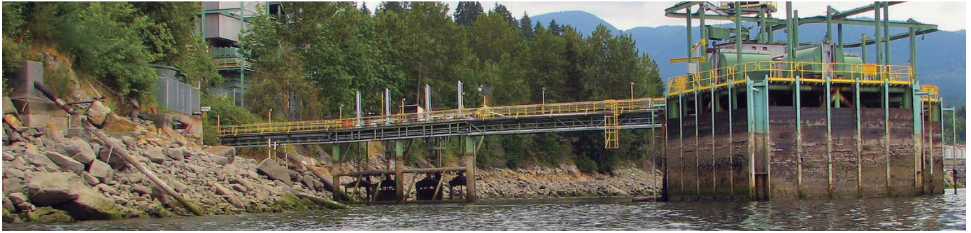
BC Hydro upgrades existing aging Bailey control system at their Burrard Generating Station in Port Moody, delivering higher levels of control and efficiency.