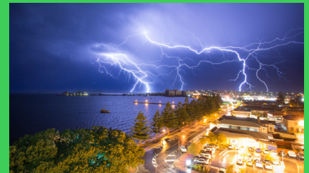
Smarter, faster power restoration