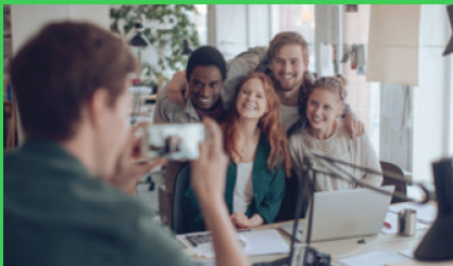
Contact us to start your journey