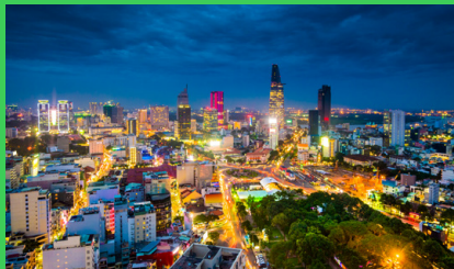
Self-Healing Smart Grid Solution Re-energizes Network in Less Than a Minute