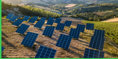
Discover EcoStruxure for Grid