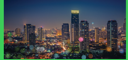
EcoStruxure solution for utilities