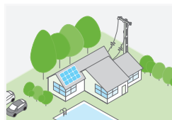
Residential grid-tie solar with backup power