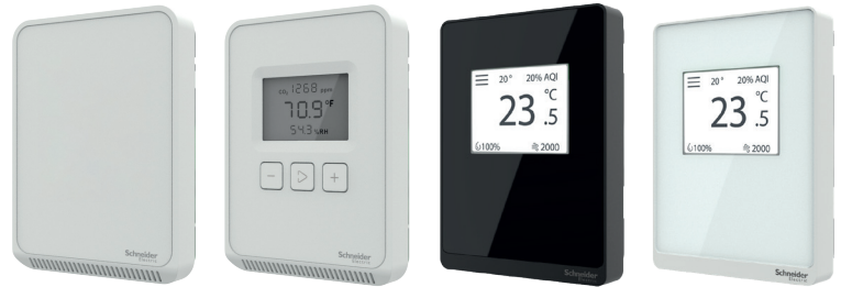
Note: A subset of models shown.