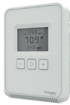
LCD with Buttons