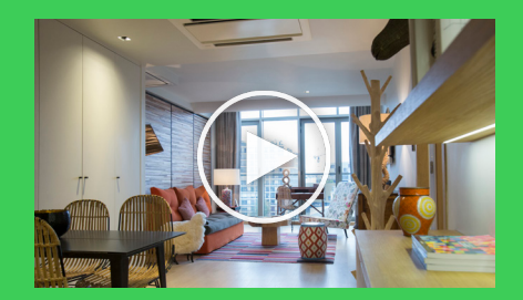
Light & Room Control EcoXpert, hotel to take the guest experience to a new level through integrated Schneider Electric.