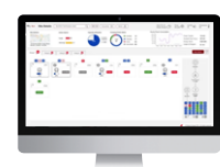
Fleet Management System