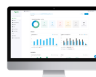
Charging Stations Management System

The EV infrastructure can be connected to a cloud-based Charging Station Management System and integrated into the Fleet Management System via API or alternative capability.