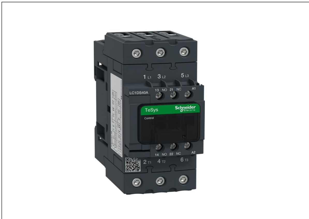
TeSys DS contactor

TeSys DS contactor, 3P(3 NO), 41A, 220VAC 50/60Hz coil, Everlink terminal