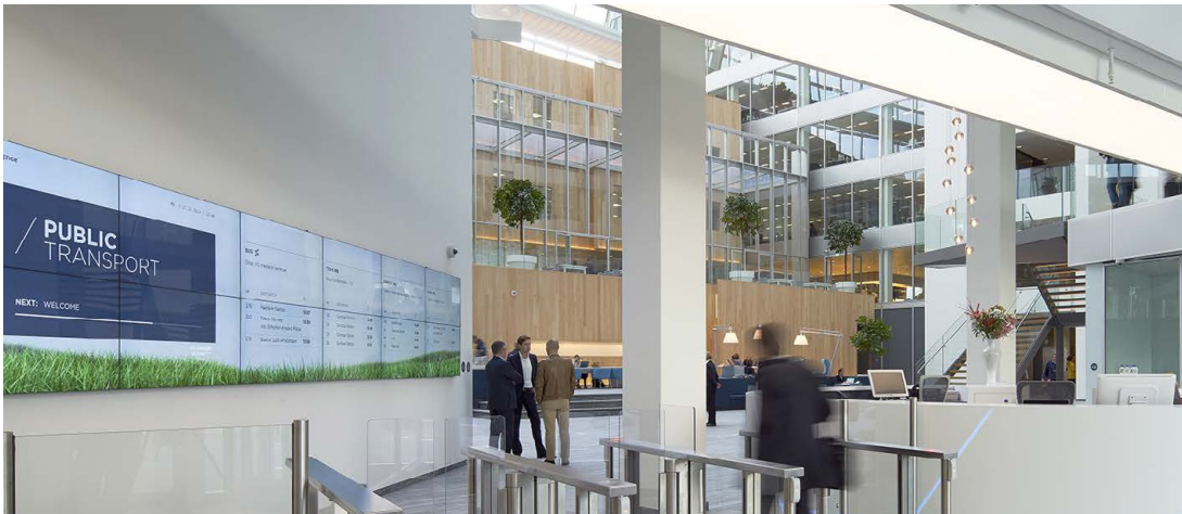
Real-time energy consumption and efficiency data gathered from the EcoStruxure™ Building Operation BMS are shared with building occupants and visitors via a dashboard located on a video screen located in The Edge lobby.