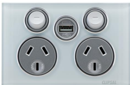
Saturn DGPO with 30USBCM Charger in Ocean Mist