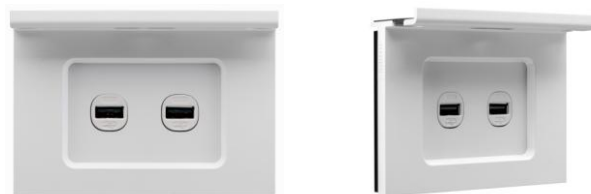
Saturn Zen Twin USB with Charging Shelf

With BC1.2 compliance and cable compensation, the 30USBCM optimizes the charging voltage and current to minimize charge time of your portable device.