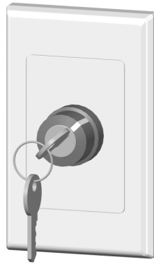
622T1 including ZB5-AG4