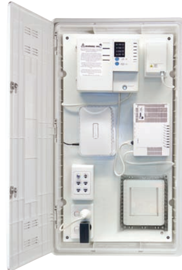
Clipsal Home Distribution Unit (3105PEN7440)