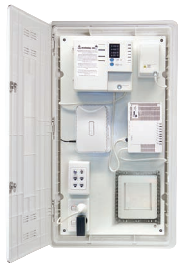
Clipsal Home Distribution Unit (3105PEN7440)