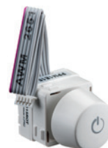
Cat No. DCDAL31SR0T