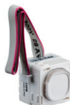
Cat No. DCDAL31SPB