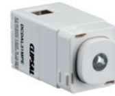
Cat No. DCDAL31MPE

The DALIcontrol 30 Series Occupancy Detector uses passive infrared (PIR) technology to detect motion within a five metre range.