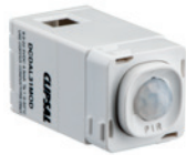
Cat No. DCDAL31MOD

The DALIcontrol 30 Series Master Switch connects directly to a DALI line for lighting control functions, including action, toggle, dimmer, memory dimmer and bell press. The master switch can also be used with or without a DALIcontrol 30 Series Slave Input.