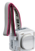
Cat No. DCDAL31SR0KUD