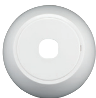
Cat No. DCPH30M

A cost-effective solution to assist in achieving compliance with BCA Section J Regulations for large open-plan areas.