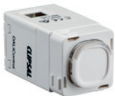
Cat No. DCDAL31M2PB