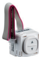
Cat No. DCDAL31SPBUD