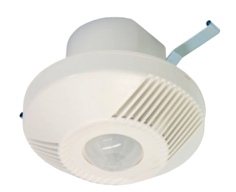
Flush-mount (base included)