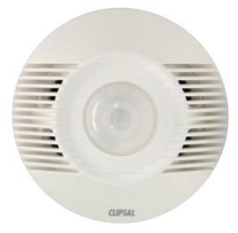
Dual-technology: PIR and ultrasonic