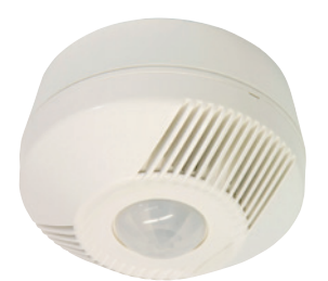
Surface-mount (base included)