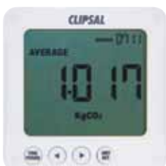
Average carbon emissions