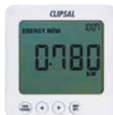
Instant electricity use