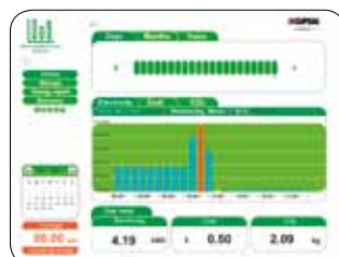
Monitor and analyse on your PC

Take control of your energy consumption!