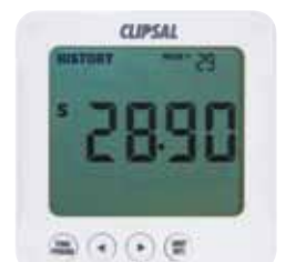
Electricity cost (approx.)