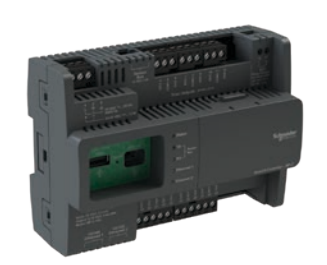
SmartX MP-C 15/18/24/36 points