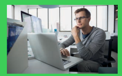
Contact us to start your journey.

schneider-electric.com/ecostruxure-building