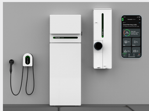
Schneider Pulse, Inverter, Boost, Charge, and Schneider Home app