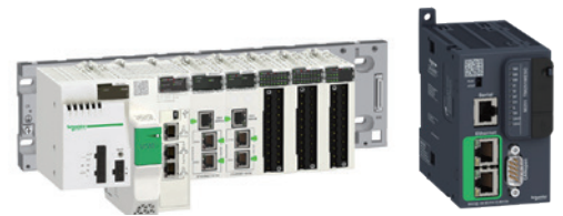
Modicon: Future-ready PLCs and PACs

One of the world's largest material handling logistics providers was building a large fully automated package handling system. It needed a turnkey power, automation, and controls vendor who could supply a system that could manage the 1 million packages a day that would flow through the facility. With 4 million square feet under the roof, the distribution center would be bigger than the Pentagon, with a power draw in the neighborhood of 75 megawatts or enough to power 75,000 homes.