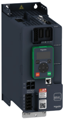
Altivar 340 Designed for high-performance applications

Programming the solution to handle all of this data took significant effort. Schneider Electric network specialists helped the OEM’s engineers optimize the program code to make the best use of the hot standby system. Despite the airport’s aggressive schedule, the Ethernet-based baggage handling system was installed efficiently and is performing to specification.