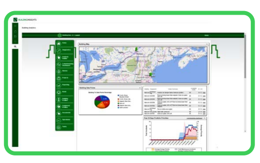
Figure 2 Examples of graphical reports available with a BMS.