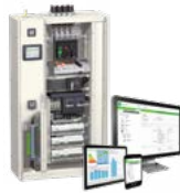
Prisma LV switchboards