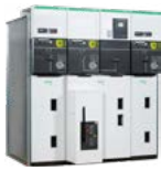
Set Series SM6 Switchgear