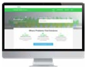
Schneider Electric Exchange