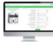
EcoStruxure Power Build - Medium Voltage