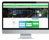
Schneider Electric Partner Portal