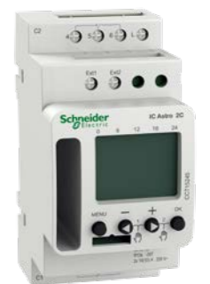
IC Astro 2C SMART

Lighting dark areas with standard switches protects against vandalism. Also, by replacing standard switches with programmable time switches, it is possible to simulate presence in residential and commercial buildings.