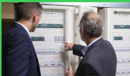
EcoStruxure Power Monitoring Expert