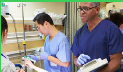
EcoStruxure Building Operation