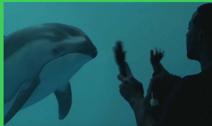
A sustainable space for 1500 species