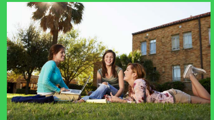
EcoStruxure™ Energy Expert increases electrical and mechanical efficiency for Lake Land College