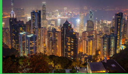
Discover EcoStruxure™ Building