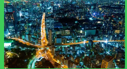
Discover Efficient & Connected Buildings