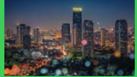
EcoStruxure™ solution for utilities