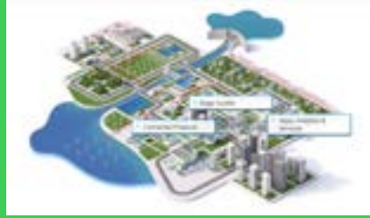
Discover EcoStruxure™ for Grid