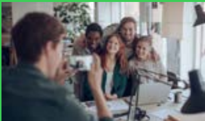
Contact us to start your journey