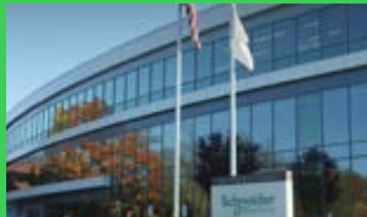
Boston One Microgrid at no extra cost