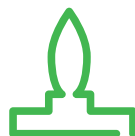
Oil & Gas applications