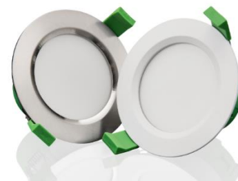
Clipsal TPDL1C1 LEDs