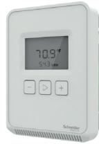
LCD with Buttons