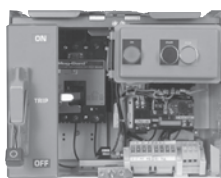
Model 6 Unit