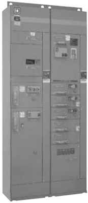
Model 6 Motor Control Center