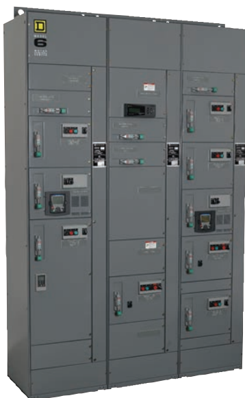
Model 6 Motor Control Center