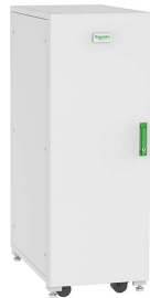
Modular Battery Cabinet