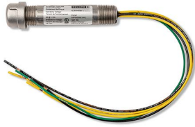
SSE Signal Protection

SurgeLogic SSE suppressor provide multi-stage surge protection designed for water and wastewater flow meter control applications, encapsulated in stainless steel pipes for quick installation.