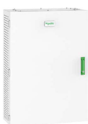
Maint Bypass Panel