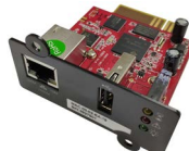
Series Network Card