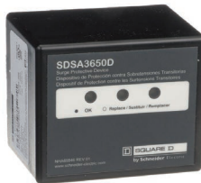
SurgeLogic™ Type SDSA