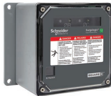
SurgeLogic™ Type EMB