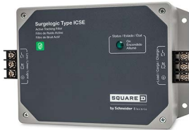
ICSE Series Filter