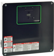
SurgeLogic™ Type EMA