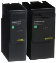
Square D™ QO / HOM PoN SPDs