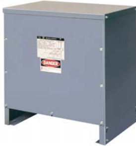
Style E—IP55 Rated

These dimensions are not for construction. Contact your local Schneider Electric representative for certified prints.