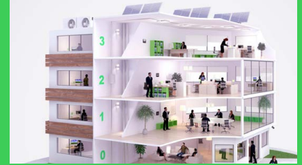
Learn EcoStruxure™ Buildings