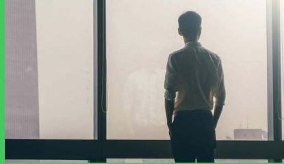
Discover EcoStruxure™ Building Advisor