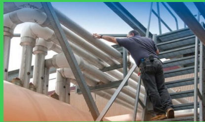
Commissioning rooftop units in a community center with EcoStruxure™ Building Advisor