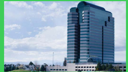
EcoStruxure™ Building Advisor* helps office building to discover efficiency opportunities.