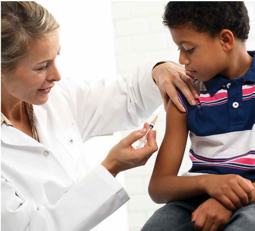
Schneider Electric Helps Sanofi Pasteur Achieve 30 Percent Increase in Overall Equipment Effectiveness

“The Schneider Electric solution has met all of Sanofi Pasteur’s expectations by providing easy migration with the existing system, high availability and a secure architecture to store and manage all the facility’s technical data.”