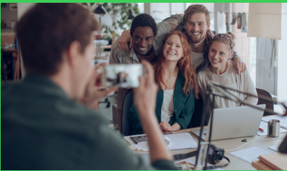
Contact us to start your journey