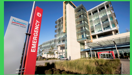
Creating a life-saving environment through EcoStruxure™