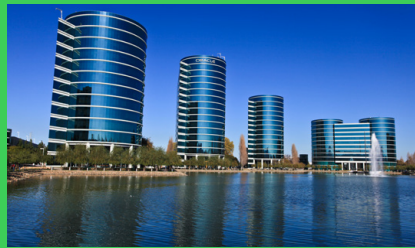
Oracle achieves high-quality power with fast payback