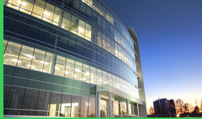
Discover EcoStruxure™ Power