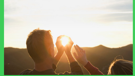
Discover Power & Energy Management Solutions