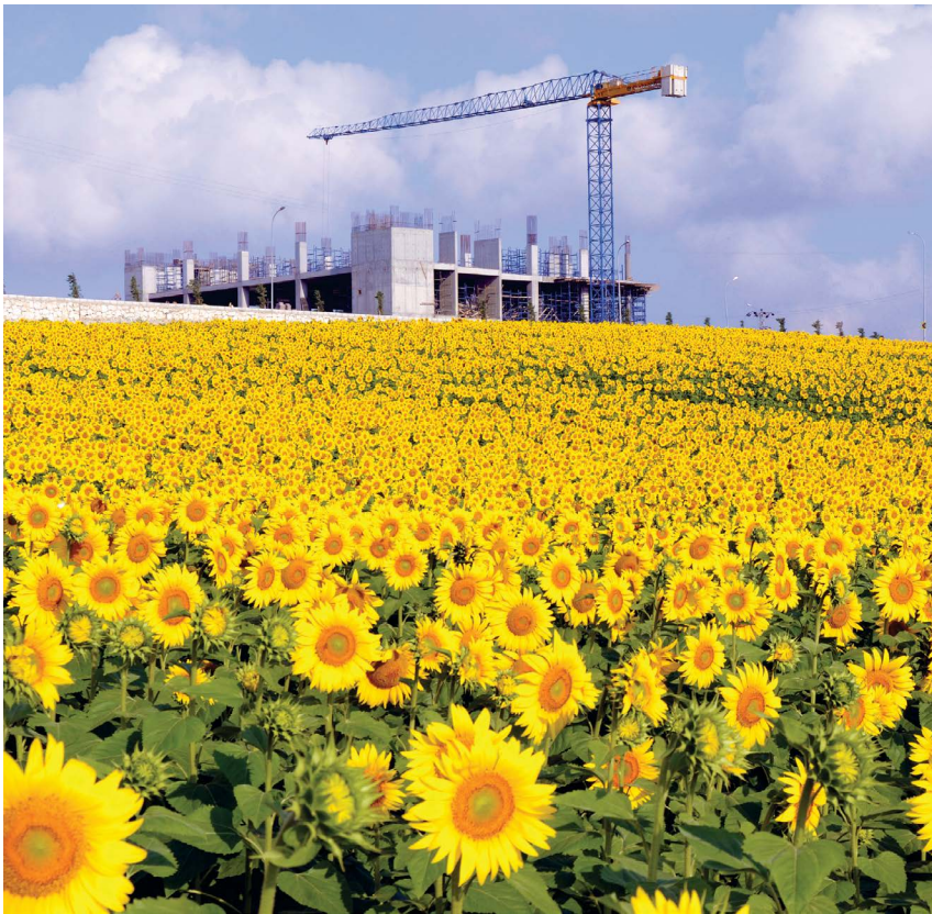
Schneider Electric Solution Helps Provide Clean, Reliable Electricity in India

“The Foxboro System is perfect for R.K.M. Powergen because it provides the power plant with a distributed solution that is effective, redundant and just the right size and price for its control requirement.”