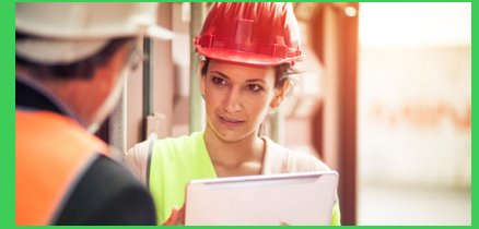
Learn more about ArcFM