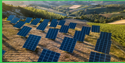
Discover EcoStruxure™ for Grid