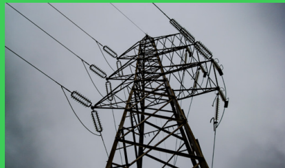
Empowering a bright, connected future with Enel