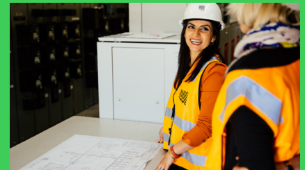
SA Power Networks: Smarter, faster power restoration