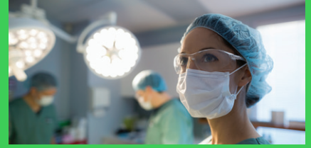
Discover EcoStruxure for Healthcare