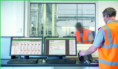
Discover EcoStruxure™ Power