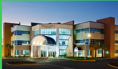
Another EcoXpert story featuring EcoStruxure for Healthcare at Watson Clinic