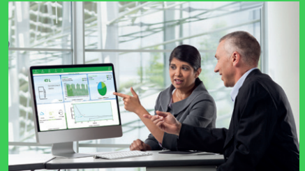
Contact us to start your journey