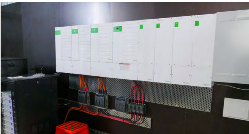
On full production days, the new solar and storage system exports up to 40kWh daily and supports loads of 50kWh daily.