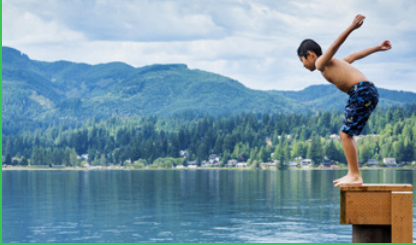
Powering remote island with sustainable electricity