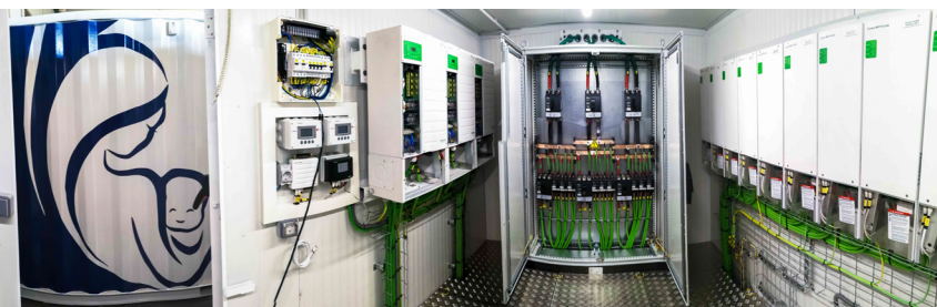
Inside of the EM-BOX

EM-ONE wanted to ensure that their solution is equipped with tier-1 products to reduce the long-term operation and maintenance costs. EM-ONE selected Schneider Electric's solar inverters and charge controllers for their robust and rugged system that withstands the harsh environment. Schneider Electric's track record in Africa was another reason why EM-ONE chose Schneider Electric over other competitors.