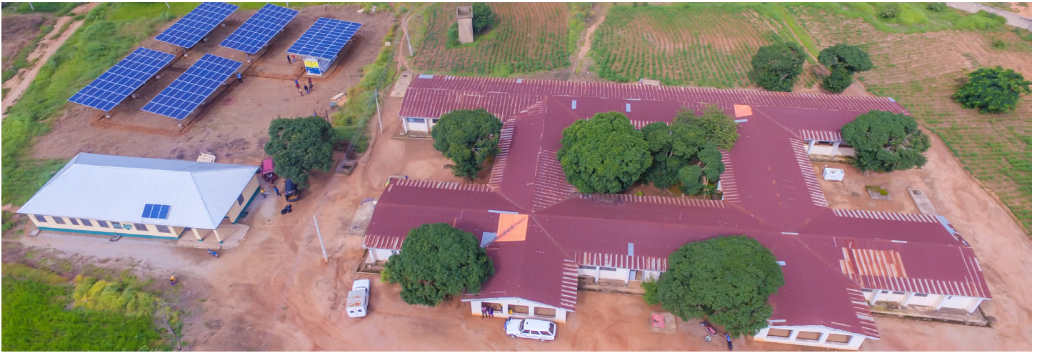
EM-ONE deployed the EM-BOX to 13 rural hospitals in Nigeria including this rural hospital in Kaduna State.

EM-ONE, a Canadian-Nigerian engineering, technology and consulting firm, delivers sustainable energy to West Africa. They built the EM-BOX, a turnkey microgrids solution to address their fundamental belief that access to modern, affordable and sustainable power is a basic human right. In 2019, EM-ONE deployed the EM-BOX to 13 off-grid rural hospitals in Nigeria. The containerized solar microgrids power the health centers' critical functions such as lighting, X-ray machines and water pumping, improving the lives of the local residents.