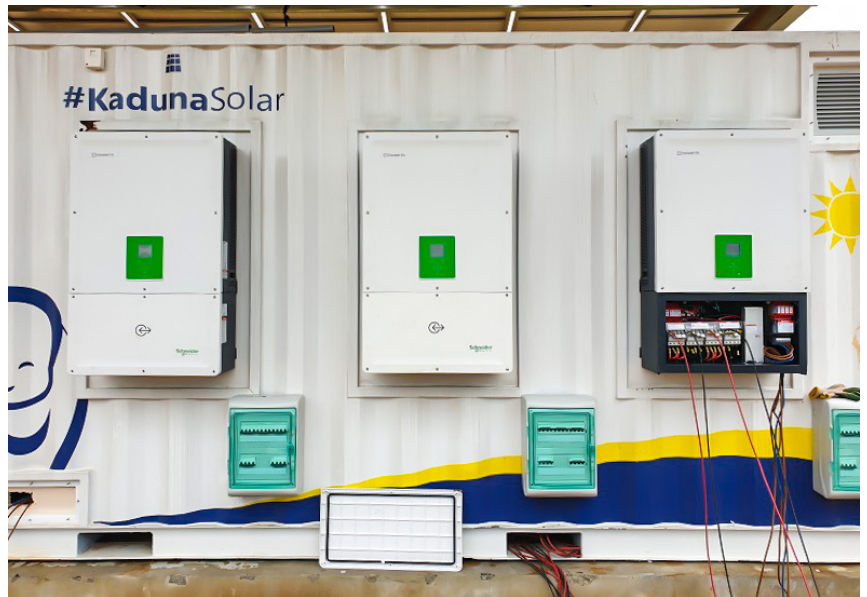
Exterior of the ES-BOX

The 13 systems will generate over 1,300 MWh of energy annually, offset over 520,000 liters of diesel, and reduce nearly 1,400 tons of CO2 emissions per year.