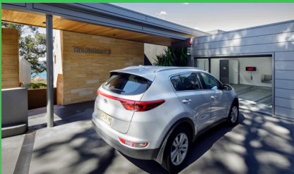
A flexible and cost-effective battery storage solution for a high-end residential development