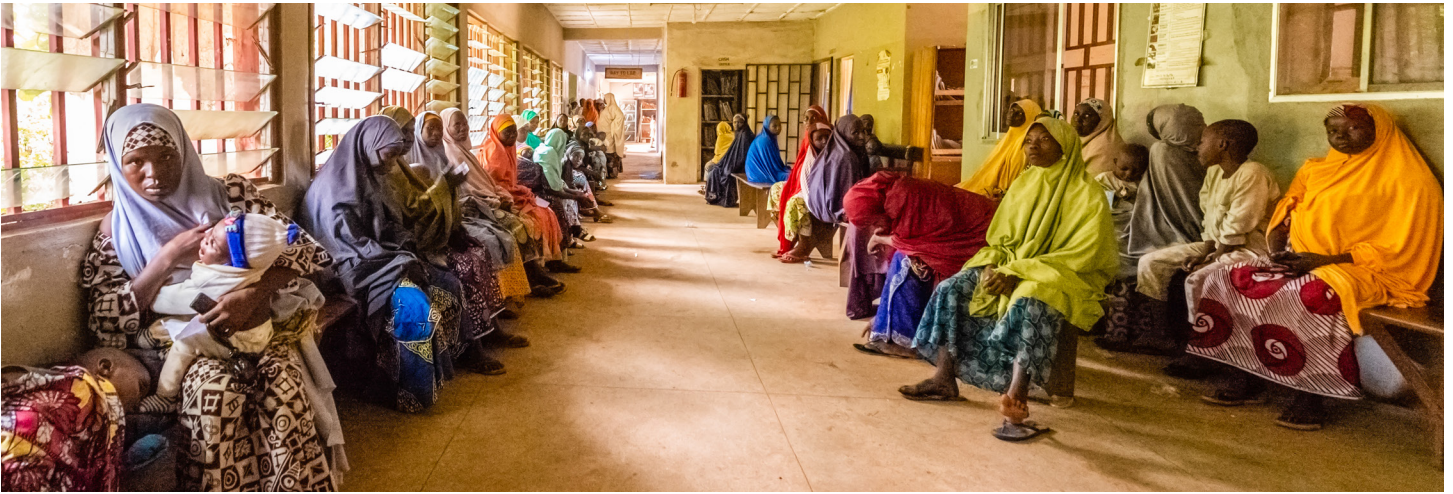
Waiting room in a rural hospital

In late 2019, EM-ONE, in partnership with UK Aid and the EU, has commissioned 13 off-grid containerized solar microgrids that power primary health centers across Kaduna State, Nigeria.