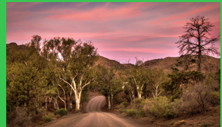
Going off-grid instead of living at the edge of the grid