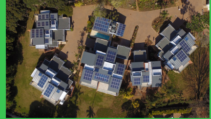
One Everton – A South African flagship for communal energy independence