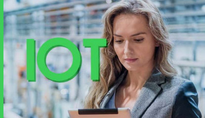
Discover EcoStruxure™ Building