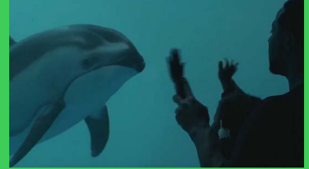
Explore Shedd Aquarium