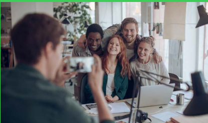
Contact us to start your journey