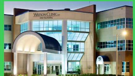
Experience Watson Clinic