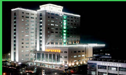
Learn about Kyunghee Hospital