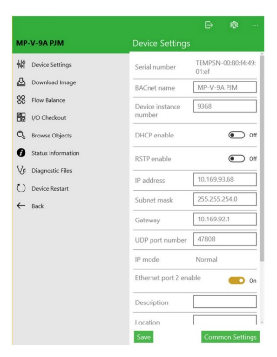
Figure 3 A screenshot of Schneider Electric's eCommission SmartX Controllers mobile app

same. Figure 3 shows a screenshot of an example of a mobile commissioning app for BMS field controllers.