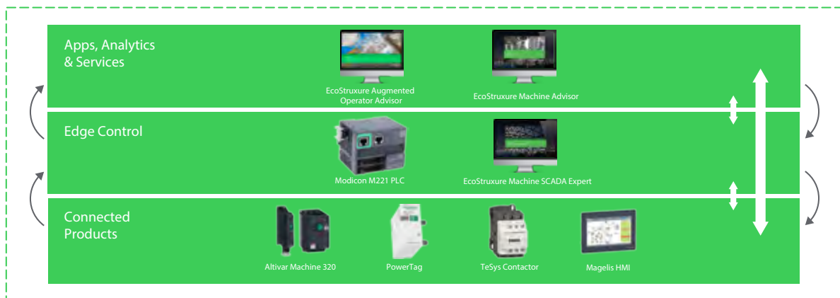
EcoStruxure™ Machine Architecture