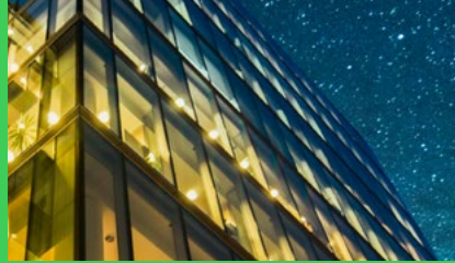
Discover EcoStruxure™ Power