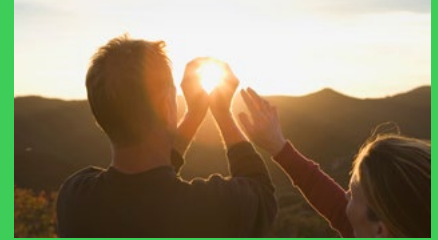
Discover Power & Energy Management Solutions