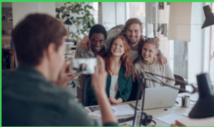
Contact us to start your journey