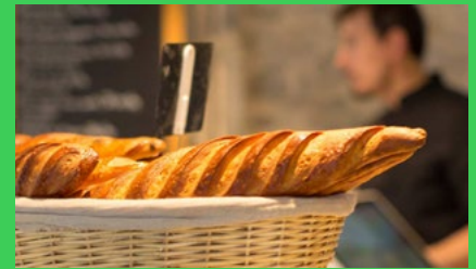
French bakery Maison Manival proves connected technology can help sustain traditional businesses