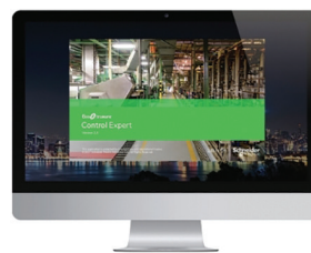
EcoStruxure Control Expert Software (formerly known as Unity Pro)