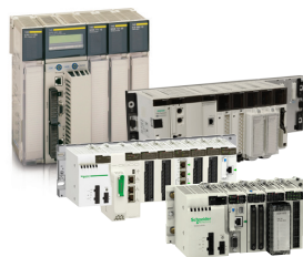
Modicon PAC/PLC Platforms