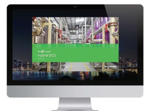
EcoStruxure Hybrid DCS (formerly PlantStruxure PES)