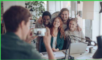
Contact us to start your journey