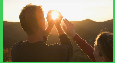
Discover Power & Energy Management Solutions