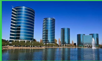
Oracle achieves high-quality power with fast payback