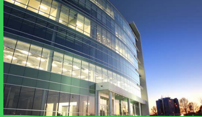
Discover EcoStruxure™ Power