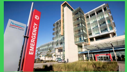
Creating a life-saving environment through EcoStruxure™