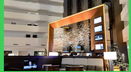
EcoStruxure™ Energy & Sustainability Services