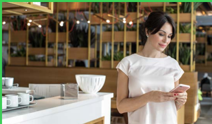
Contact us to start your journey