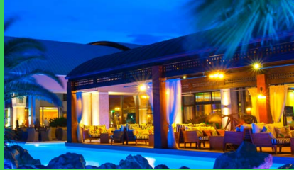
Discover EcoStruxure™ for Hotels