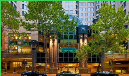
Sheraton on the Park saves 15% on energy bill thanks to EcoStruxure™ Building upgrade