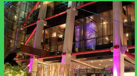
Barcelona Tower Hotel achieves 30% energy savings with EcoStruxure™