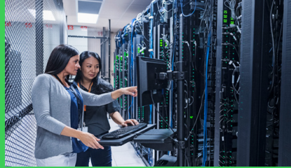
Discover EcoStruxure™ for IT