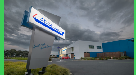
Realizing a bold vision of a modern data center