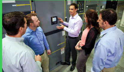
Growth through reliable operations supported by EcoStruxure™