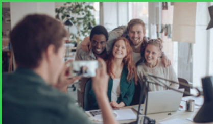
Contact us to start your journey