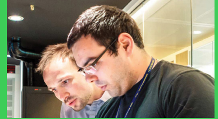
EcoStruxure™ for Enterprise Data Center