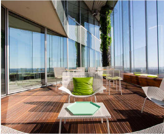
Tour Majunga in La Défense, reinvents the concept of office buildings