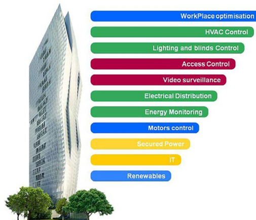
EcoStruxure Building Operation