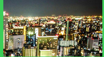
Discover Schneider Electric solution for Utilities