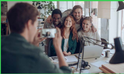
Contact us to start your journey