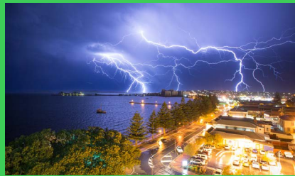
Smarter, faster power restoration