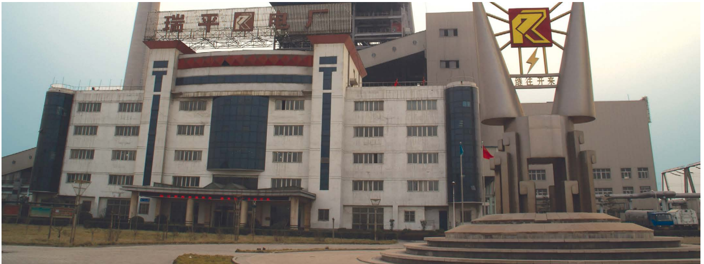
China's Ruiping Power Plant partnered with Schneider Electric to meet demanding energy-saving and emission-reduction targets.