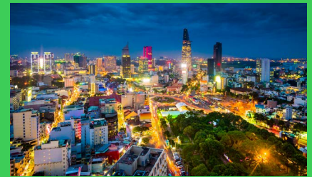
Self-Healing Smart Grid Solution Re-energizes Network in Less Than a Minute