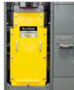
Cable vault is designed to isolate arcs on the line side conductors