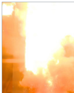
Traditional MCC Arc Flash Event: 100kA@480V

This robust unit can now be specified for new installations or retrofit as a new main section as part of a modernization project to add protection to your existing Model 6 Motor Control Center (MCC) installation.