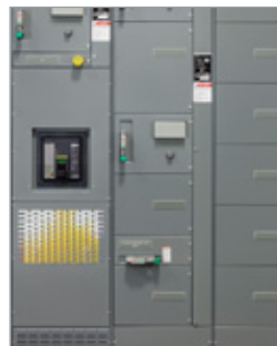
ArcBlok MCC Arc Flash Event: 100kA @ 480V